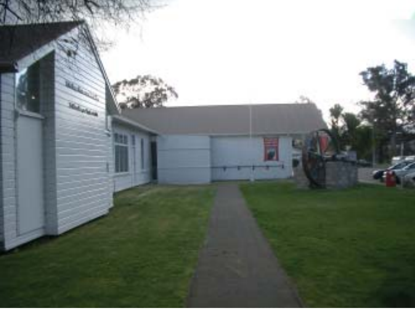
Side view museum